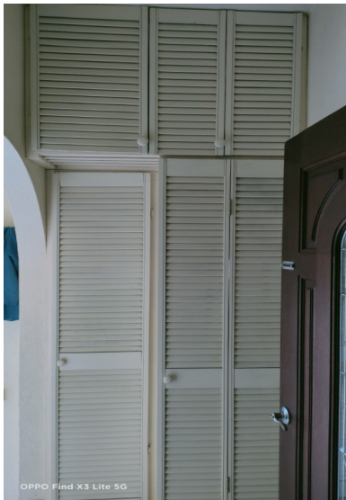
Beach towels and cleaning supplies