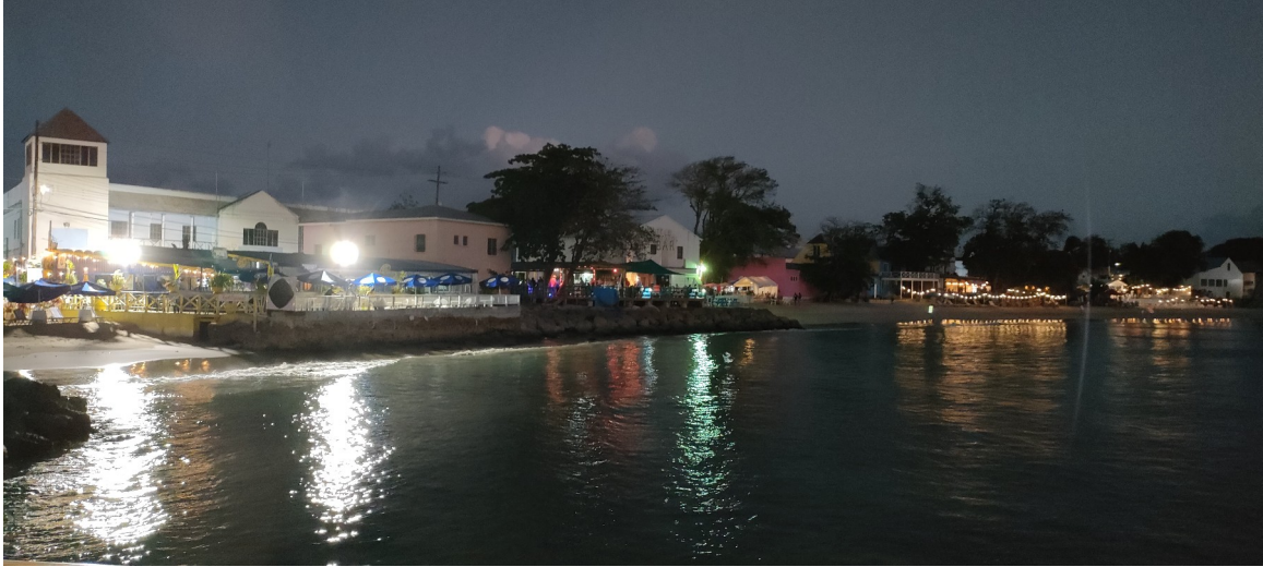
The waterfront at night in Speightown