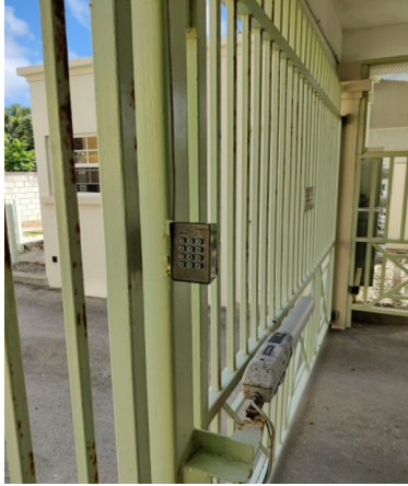
Image 1 Gate