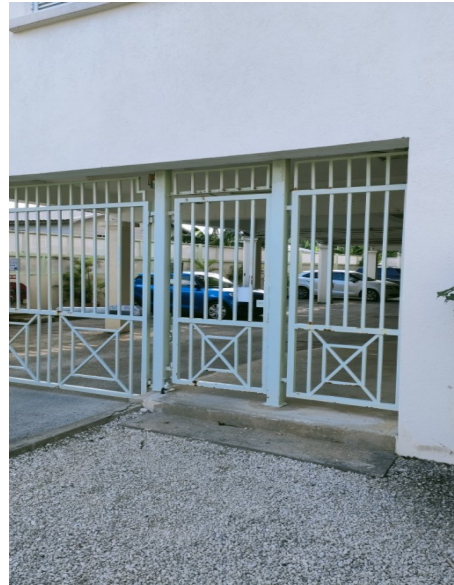
Back Entrance Gates